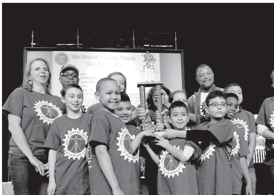
Northampton County's Willis Hare Elementary/Conway Middle School's 'The Roboticians' took home the Champion Award in the recent Ultineers 4th Invitation Robotics Tournament.

The afternoon robot game competition showed the amazing work the